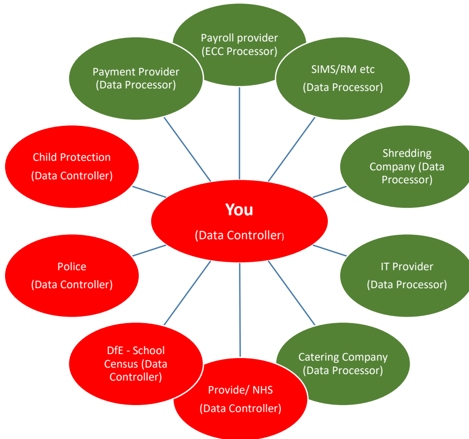
Diagram showing the types of Data Processor a school may work with (Green), and the types of sharing that may occur with other Data Controllers (Red).